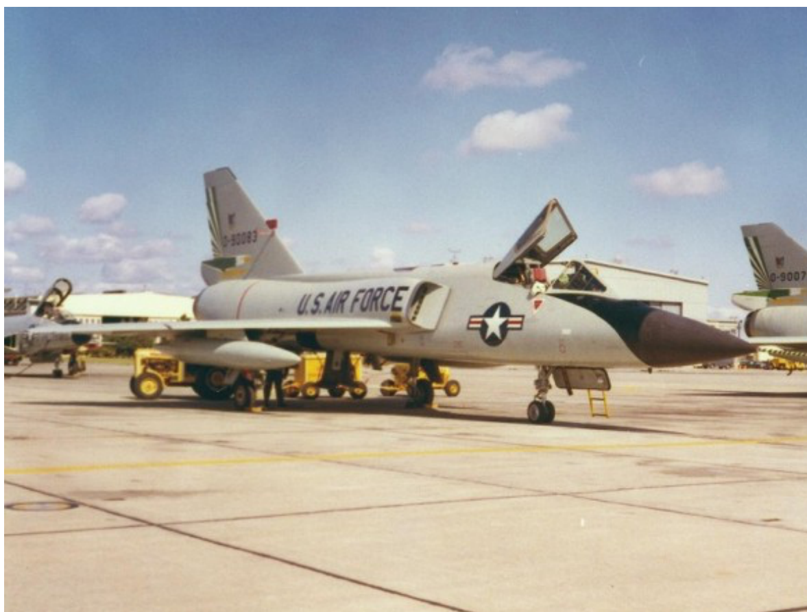
49 Fighter Interceptor Squadron F-106