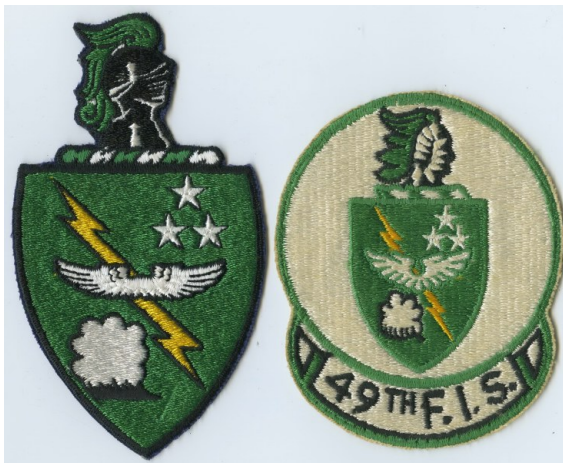
49 Fighter Interceptor Squadron emblems