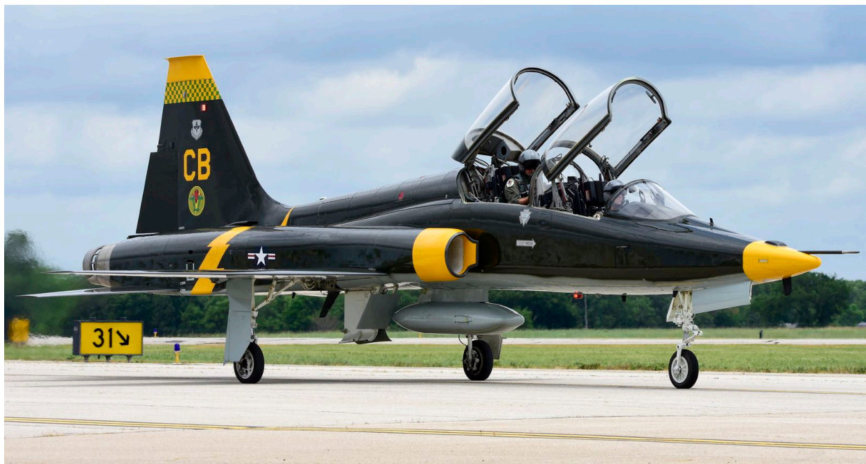
49 Fighter Training Squadron T-38