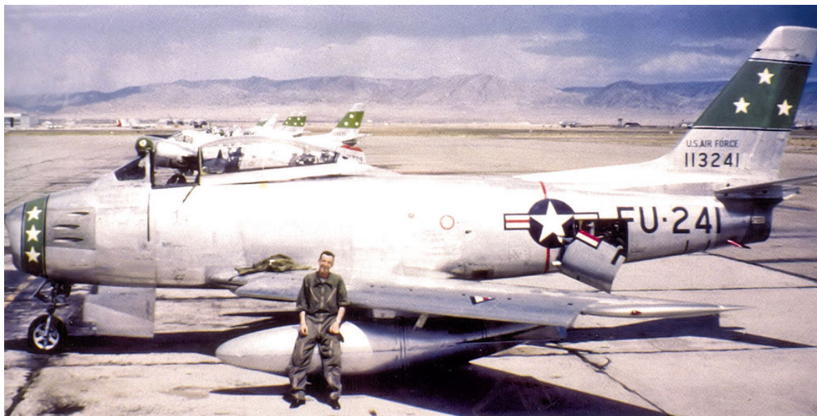
49 Fighter Interceptor Squadron F-86