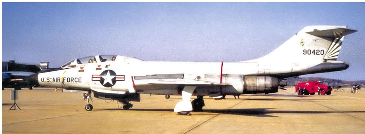
49 Fighter Interceptor Squadron F-101