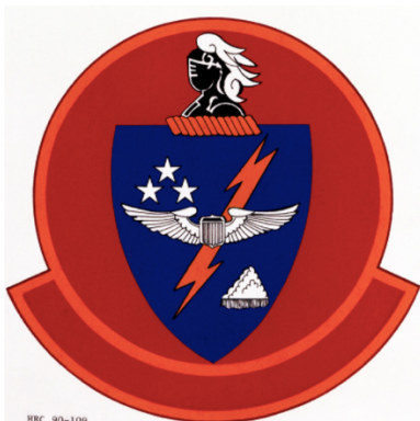
49 Flying Training Squadron emblem